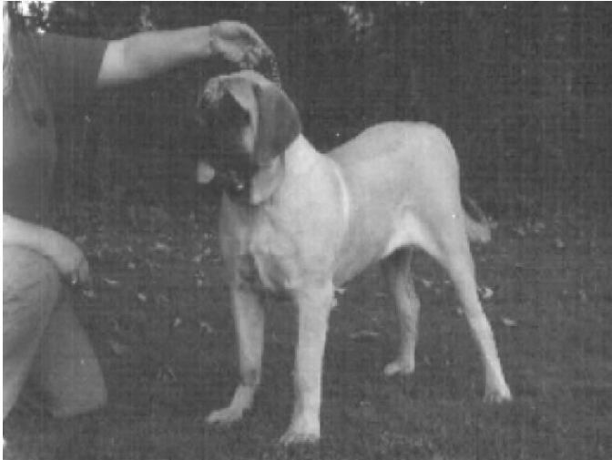
1 st Minor Puppy Dog Chevelu Easter Parade for Heffalump (Dodd-Utting)