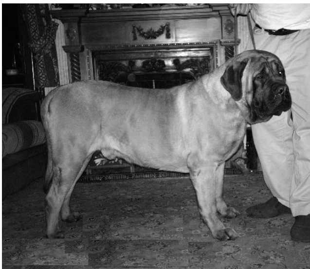
1 st Novice Dog. Klanzmun Gaius (Knight)