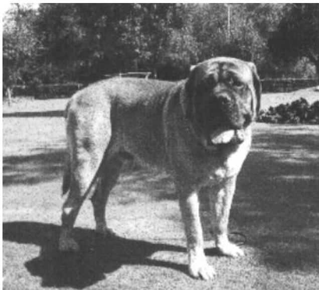
2 nd Limit Dog Orkadis Aberdeen Reserve Best Dog Angus of Tariya (Williams)