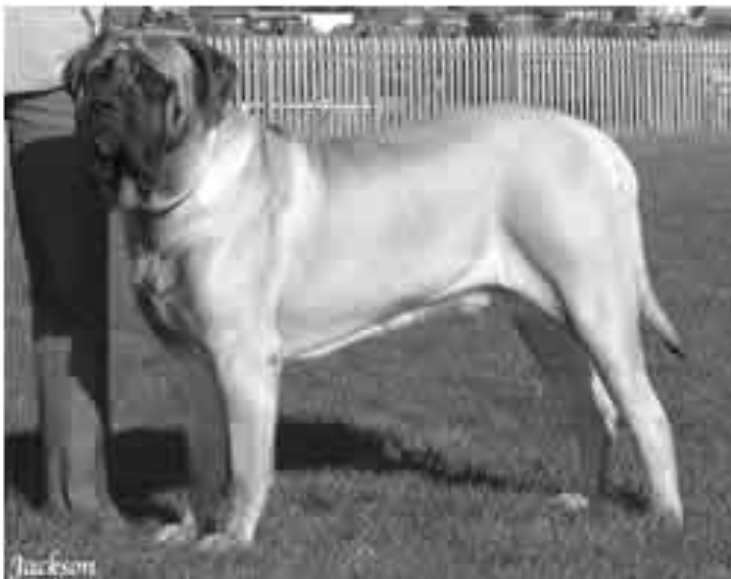
1 st Post Graduate Dog. Bronson Bromley (Simper)