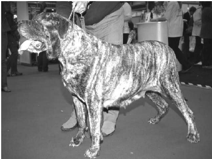
Photo by Jan Wright www.janwrightphotography.co.uk who is happy to do home visits at reasonable cost