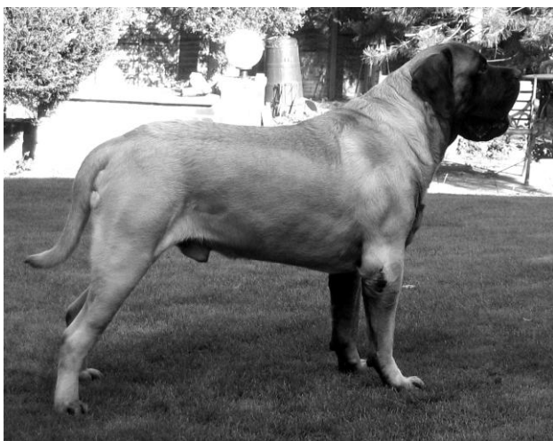
1 st Limit Dog Harting Captain Midnight (Jenner) Best Dog and Best Opposite Sex In Show