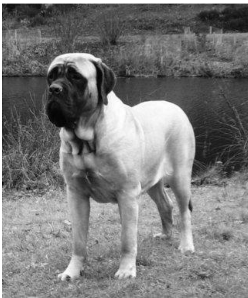
1 st Junior Bitch- Fragilis Firienfield for Hexnorden (Norris) – Reserve Best Bitch & Reserve Best In Show