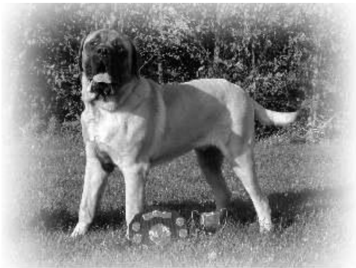
1 st Puppy Dog. Morganlefay Danshe (Bowdery) Best Puppy Dog