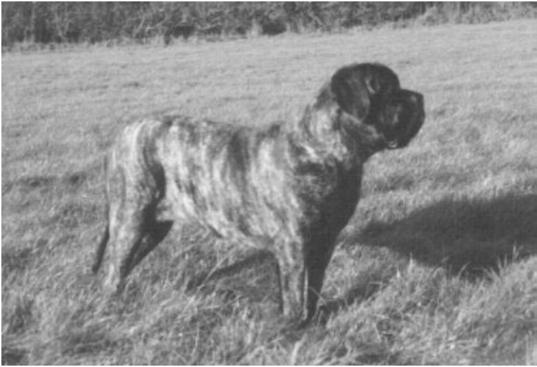
1 st Novice Bitch Fragilis Fanfare (Proudfoot)