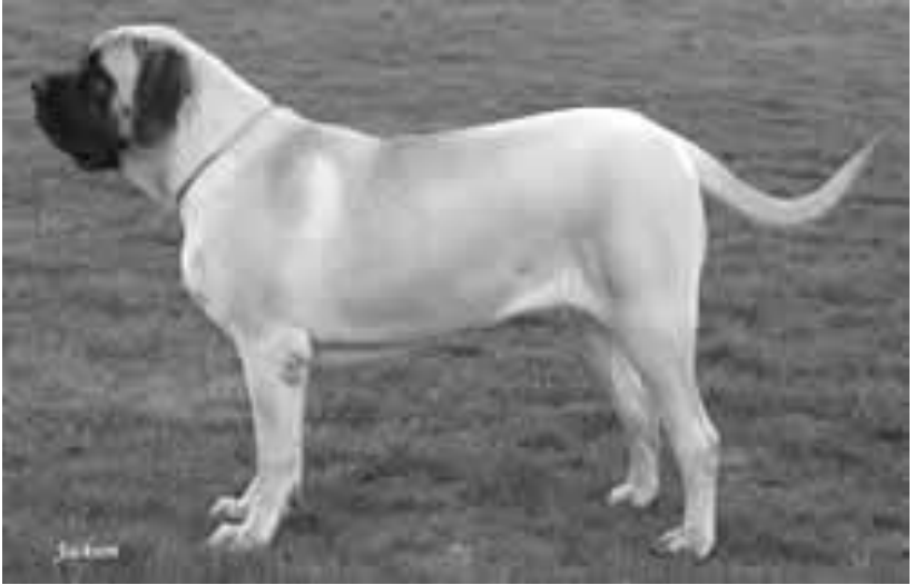
1 st Special Yearling Bitch Kumormai Capuche (Knight)