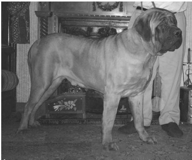
1 st Junior Dog Klanzmun Quintillus via Kumormai (Knight)