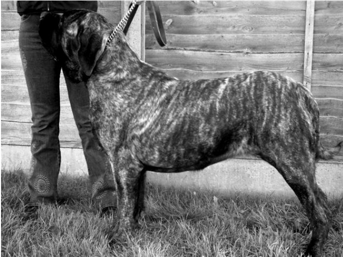
1 st Minor Puppy Bitch. Cyberus Carnelian (Andrews) Best Puppy Bitch and Best Puppy In Show