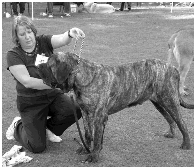
1 st Open Dog. Kumormai Crouching Tiger (Knight)