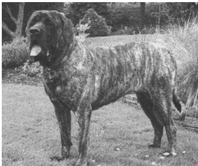
1 st post Graduate Bitch Farnaby False Economy (Baxter)